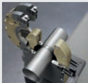
/ Perfect welds due to closed chamber