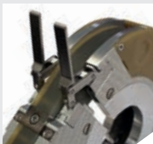
/ Spring loaded clamping system