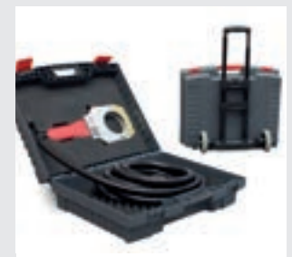
/ Transport case with trolley