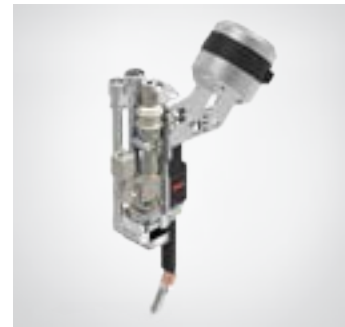
4 KW / 6 KW ULTRAKOMPACT