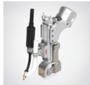
10 KW FILLET WELDING HEAD