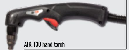
AIR T30 hand torch