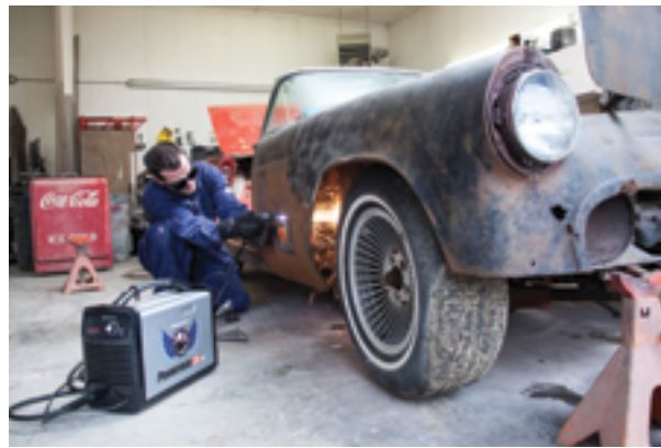
Vehicle repair and modification